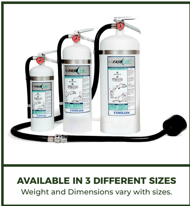
AVAILABLE IN 3 DIFFERENT SIZES Weight and Dimensions vary with sizes.